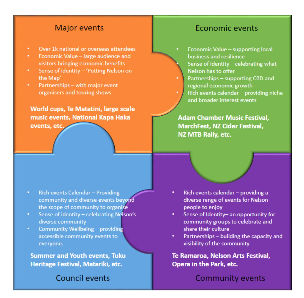
Figure 2: Events occurring in our region

Council will carry out the following actions over the 10-year LTP period: