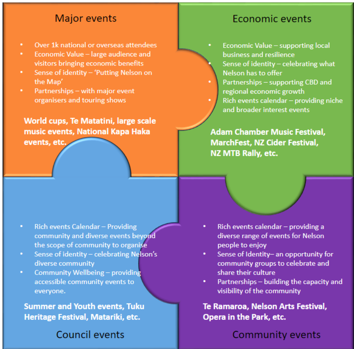
Figure 2: Events occurring in our region

Council will carry out the following actions over the 10-year LTP period: